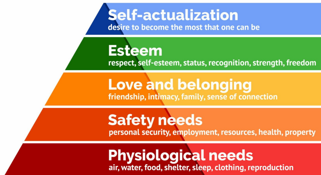
Maslow's hierarchy of needs